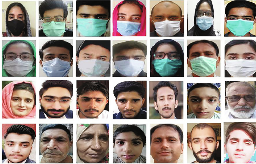
Fig. 3. Sample images of our MDMFR dataset.