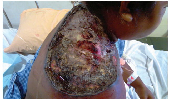
Figure 3: Wound after first debridement.

Fungi of the class zygomycetes are distributed worldwide and are commonly found in the soil and in plant debris [2]. Infections with this class of fungi occur in patients who have a history of trauma with underlying conditions of