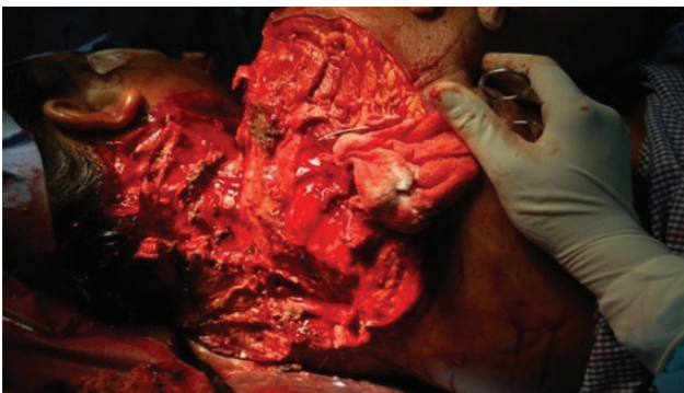
Figure 5: Wound after second debridement.

damage. This can also cause formation of emboli, infarcts and tissue necrosis.