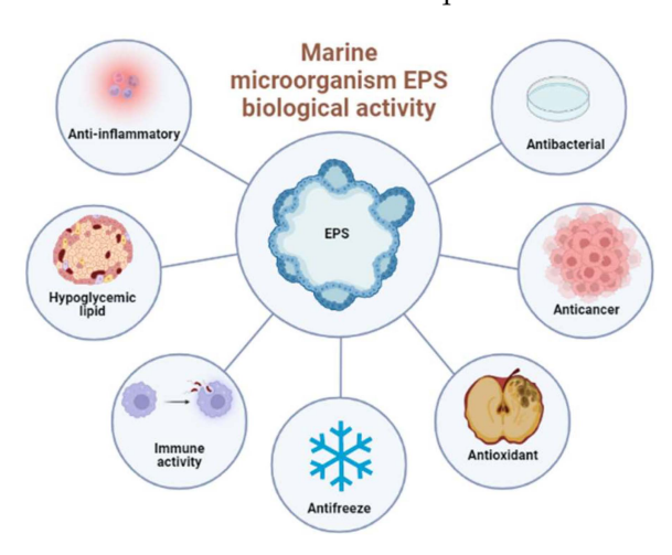
Figure 2. Main biological activities of EPS from marine microorganisms.

The structure of the marine microbial EPS is complex and diverse [101], and is linked to various biological activities, such as antibacterial, antioxidant, anti-cancer, antifreeze, anti-inflammatory, enhancement of immune activity and blood pressure, and lipid reduction [102–105]. In addition, due to the particularity of the marine microbial environment, the EPS produced by marine microbials also have a potential application value in the marine ecological environment. Here, we mainly introduced the antioxidant activity, anticancer activity, anti-infectious activity, and immune-enhancing biological activity of the marine microbial EPS (as shown in Tables 1–3 and Figure 2) and their potential application in bioremediation and carbon sequestration.