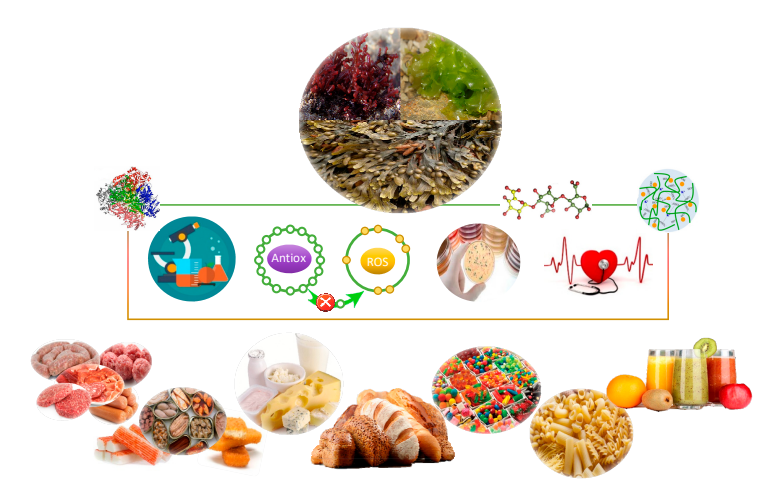
Figure 2. Functional and technological applications of seaweeds and their extracts in food products.

their quality, and their health-related beneficial properties [155]. Furthermore, macroalgae can be also used by their technological properties, since they contain in their composition phycocolloids, such as agar, alginates, and carrageenan, which are highly valued for their gelling, thickening, and stabilizing properties [156,157]. It is estimated that these compounds involve the 39% of the world production of colloids [158]. The contents of bioactive and technological compounds depend on the species. Thus, brown algae stands out for its contents in alginic acid, fucoidan, and laminarin present in Macrocystis spp., Laminaria spp., and Ascophyllum spp.; green algae has significant contents of ulvans; and red algae are rich in agar ( Gelidium spp.), carrageenans ( Chondrus spp.), floridean starch, porphyran, water-soluble sulfated galactan, and xylans [159].