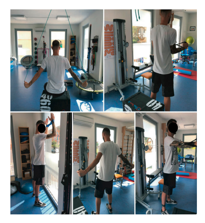
Figure 3. Images showing the patient performing a series of isometric, concentric, and eccentric isotonic exercises. Exercises were graded according to the patient's ability to handle an increasing difficulty of task focused on the stability of the glenohumeral joint (GHJ) and the scapulothoracic joint (STJ).