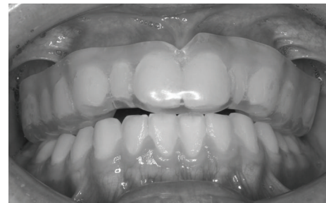
FIGURE 3: A night guard may be one of the possible solutions to prevent overloading of the suprastructure of implant prostheses. Soft material also could be used for night guards.

On the other hand, some investigators proposed a pharmacological approach for bruxism patients with implant prostheses [56, 57], especially in cases where oral implants failed as a probable consequence of severe, polysomnographically confirmed sleep bruxism. As the patient had the wish to be reimplanted after this failure, the operators decided to try diminishing the frequency of bruxism and duration first. The selected management strategies, the administration of low doses of the dopamine D1/D2 receptor agonist pergolide finally resulted in a substantial and lasting reduction in the bruxism outcome measures under study.