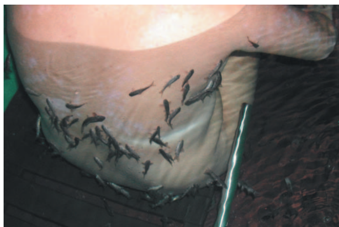
Figure 1. Patient sitting in standard treatment tub during therapy with the Kangal fish G. rufa .

skin scales of bathers, reportedly reducing illnesses such as psoriasis and atopic dermatitis (6).