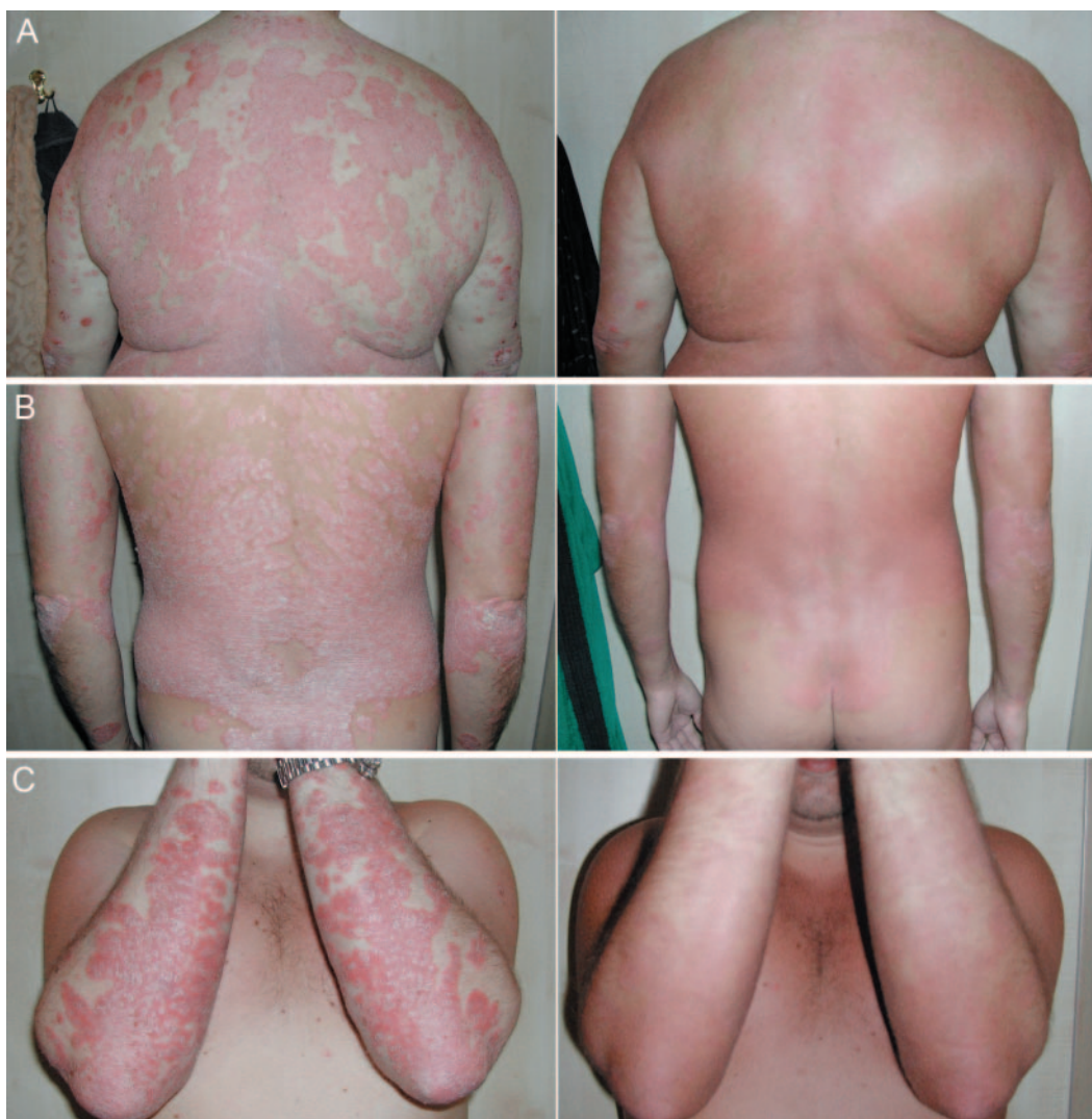
Figure 4. Three patients before and after a 3 week combined treatment with ichthyotherapy and UVA radiation.