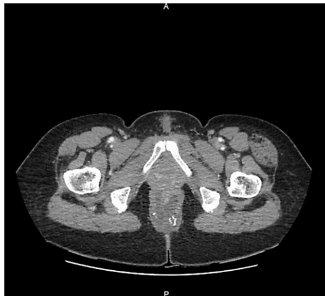
Fig. 1. CT scan showing a polycystic retroanal mass containing calcifications.