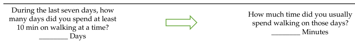
Table A2. Physical activity.