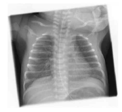
Fig. 2. Chest X-ray of the neonate on day one shows radiologic signs of mild respiratory distress syndrome (RDS).

Pressure controlled mechanical ventilation was applied with a lung protective strategy according to current guidelines on ventilation for patients with ARDS including deep sedation, intermittent prone position and administration of neuromuscular blocking agents [4–6]. On admission day 15, continuous iNO at 20 ppm was added due to the increasing oxygen need. The patient was treated with continuous iNO for five days at gradually reducing concentration; nevertheless, the NIH do not recommend routine use [7]. To minimize fetal exposure, the patient was treated with 40 mg prednisolone daily from two days prior to birth