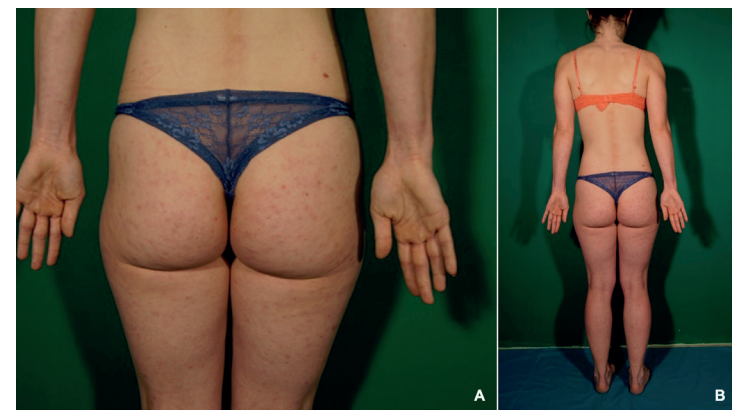
Fig. 1. Disseminated inflammatory papular lesions on the buttocks and volar forearms, on the entire surface of the lower limbs and a few lesions located on the lower back, which appeared 3 days after the first dose of human papillomavirus (HPV) vaccine.

A diagnosis of PLEVA was made based on the clinical features and histopathological data. The patient was given a course of oral azithromycin, 250 mg daily for 7 days, and mild corticosteroid ointment was applied for 1 month. Subsequently, it was decided to continue therapy with 5 cycles of azithromycin (1 dose of 250 mg