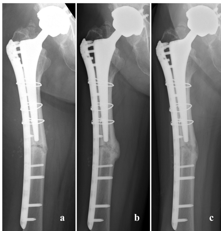
Figure 3 Radiographs obtained after osteosynthesis. (a) Just after the surgery. (b) At 6 months after surgery. (c) At 2 years after surgery.

She regained the ability to walk, although her activity was limited by her comorbidities, especially interstitial pneumonia. The latest follow-up was performed 2 years after the fracture surgery. She had no pain in her right hip joint or thigh. She could walk with a cane at home and used a wheelchair outside the home. A radiographic examination revealed no displacement or loosening of the implants, and the fracture site had remodeled well (Figure 3).