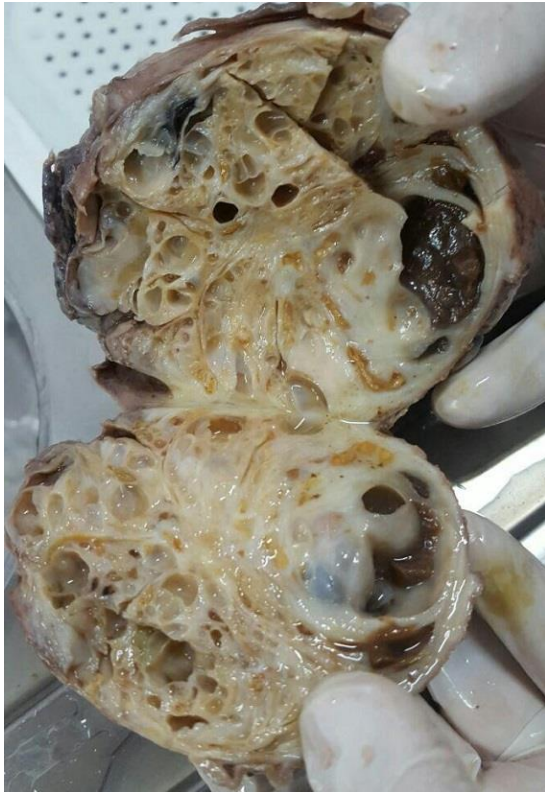
Figure 2: An overview of the mass