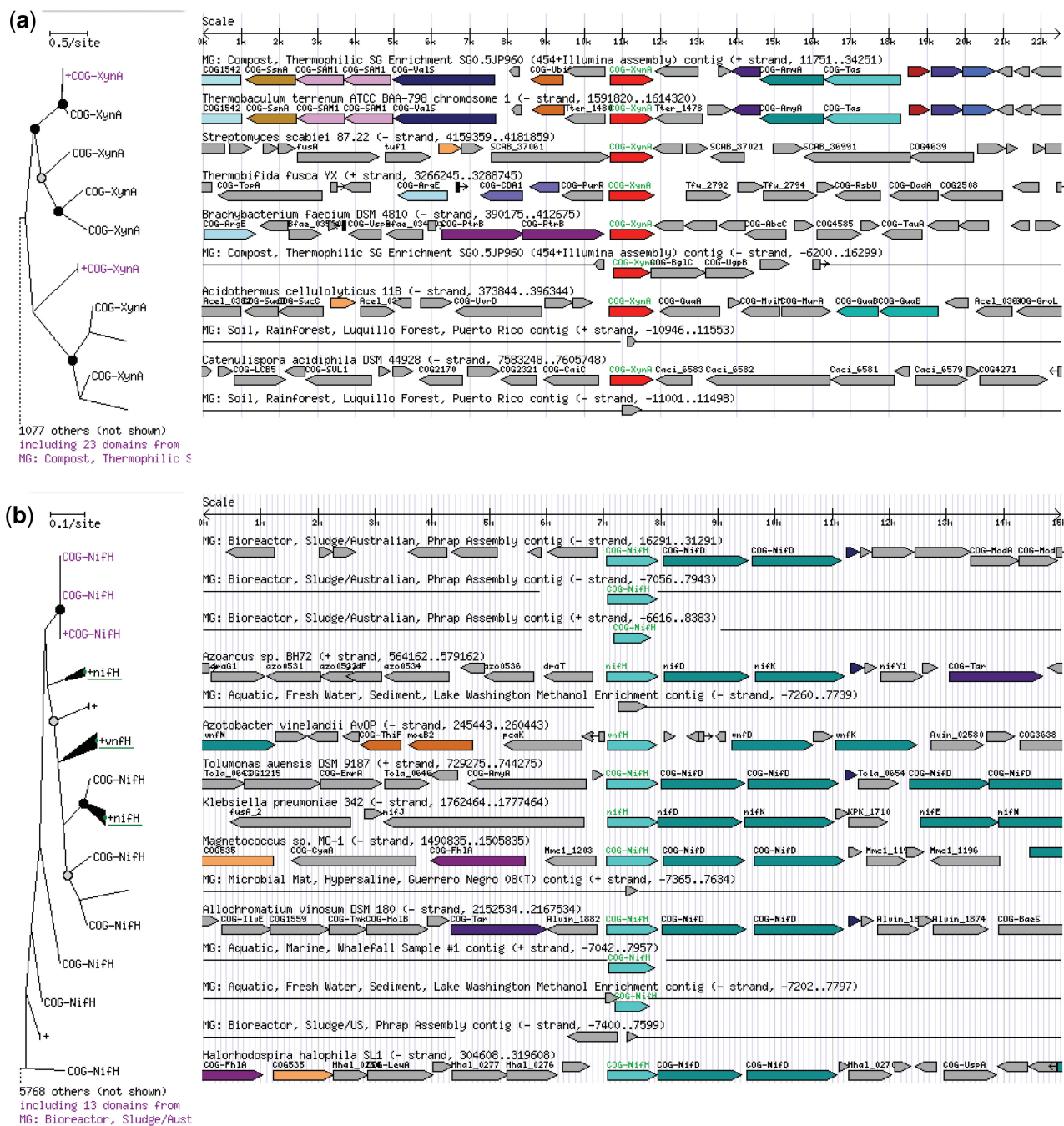
Figure 3. Tree-based genome browser. Local region of gene tree on left and local region of genome or contig on right (not shown: configuration of gene/domain family, percentage identity for collapsing closely related genes, number of rows to display, update button and zooming and panning options). Genes in same COG are shown in same colour. Any gene in browser can be clicked on to show more information or to reset as the target gene (if it has an assignment to a gene/domain family). Contigs shorter than window have lines indicating edge of truncation. (a) Strong synteny between compost metagenome contig and Thermobaculum terrenum genome increases confidence in species assignment. (b) NifH genes in metagenomes and microbial genomes show proximal conservation of related system genes, information that may be used for discovery of novel system components.