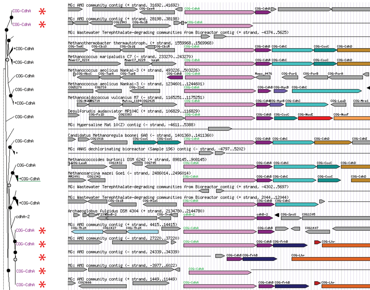
Figure 5. CdhA gene subfamily enrichment. Contigs from anaerobic methane-oxidizing community (AMO) are indicated with red asterisk. Lack of upstream synteny for very closely related carbon monoxide dehydrogenase genes with AMO community suggests expansion of gene by either horizontal transfer or lineage-specific expansion. Image truncated for clarity.

a gene family may be putatively propagated to the unknown gene.