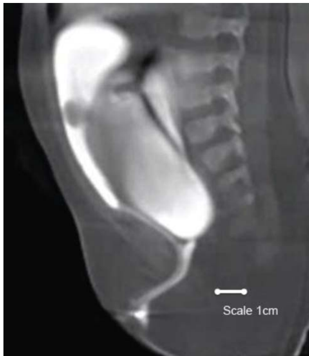
Fig. 1 Cloacagram (using water soluble contrast).