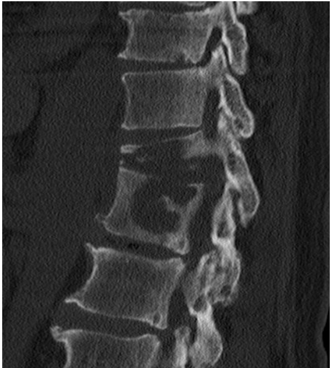
FIGURE 1: Preoperative sagittal CT

Preoperative sagittal CT demonstrating erosive, lytic changes of the T11 and T12 vertebrae with compression deformity of the T11 vertebra.