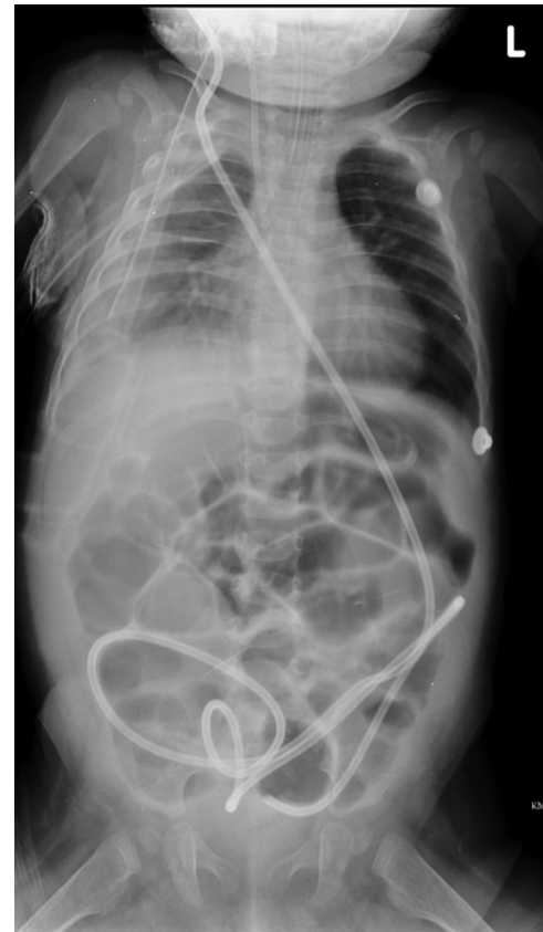
Fig. 4 Postoperative chest and abdomen roentgenogram after revision of the shunt showing resolving effusion and appropriate shunt repositioning.