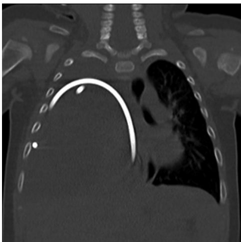
Fig. 3 Computed tomogram (CT) thorax depicting shunt migration and cerebrospinal fluid (CSF) hydrothorax.

Neurologically, the child was active and anterior fontanelle was lax. A chest roentgenogram (► Fig. 2 ) and computed tomogram (CT) (► Fig. 3 ) of the thorax revealed complete shunt migration into the pleural space with significant pleural effusion on the right side. The distal shunt system on CT appeared to enter the pleural space below the 8th rib, probably indicating that there was subcostal tunneling of the shunt below the 8th rib space during the first surgery which was inconspicuous and subsequently over a span of 3 months due to sucking effect of negative intrathoracic pressure the shunt gradually migrated into the pleural cavity which led to the effusion. An emergency VP shunt revision was performed. The distal end below the chamber was retunneled subcutaneously into a new incision in the left paraumbilical region. Postoperative chest and abdomen roentgenograms showed resolving effusion and accurate shunt placement (► Fig. 4 ). The child required elective ventilation to tide over the underlying collapse of the lung and an intercostal tube drainage for the CSF hydrothorax to aid in weaning. The child was discharged on the 5th postoperative day.