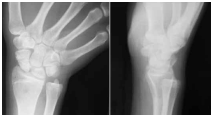
Figure 2 – Anteroposterior and lateral radiographs showing pseudarthrosis of the scaphoid in the middle third.

At a follow-up assessment of wrist function one year after the operation, the Green and O'Brien assessment system was used (34) . This classified the patient's functional ability as excellent, since the score presented was greater than 90 (Figure 4).