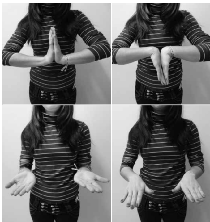
Figure 4 – Functional result.