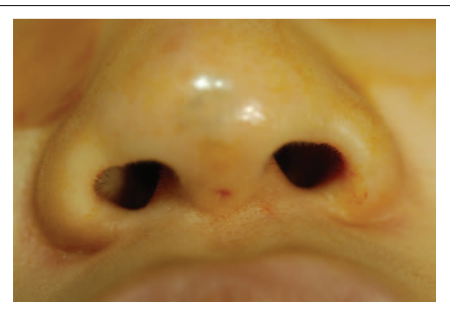
Figure 1. The opening of nasal dermoid cyst was observed in the nasal columella.