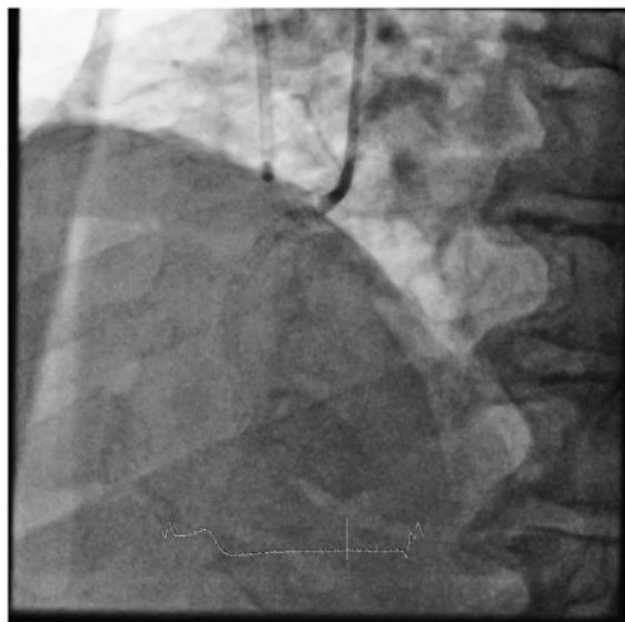
Figure 1 Thrombotic ostial occlusion demonstrated in the right coronary artery with TIMI 0 flow.