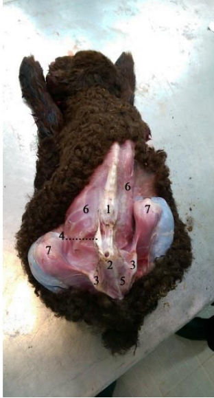
Fig. 3. As seen in the photo that taken after autopsy, the spine was seem normal. 1) Thoracic vertebrae, 2) Sacrum, 3) Wing of ilium, 4) Muscular sheath, 5) Sacroiliac junction, 6) Ribs, 7) Stifle, 8) Spinal cord.