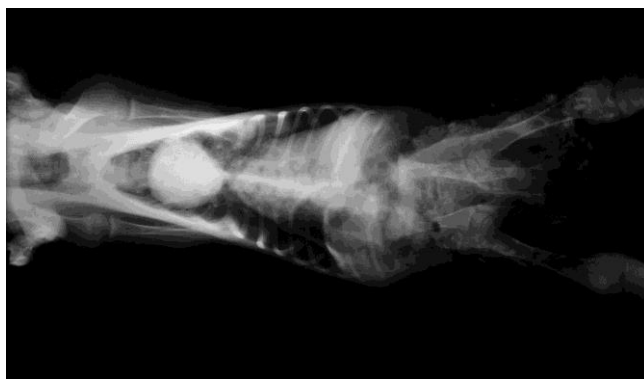
Fig. 2. Thoracic and abdominal organs were seen normal, the sacrum and hind limbs were normal in venterodorsal radiograph.