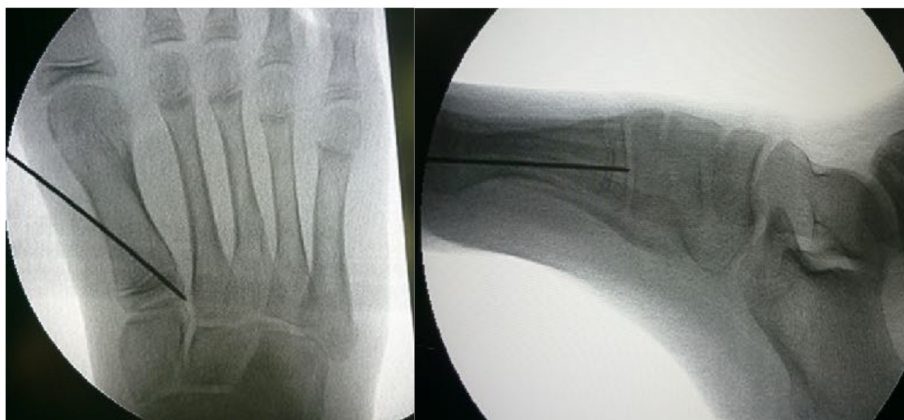
Fig. 3 Under fluoroscopic guidance, a guide wire is inserted from the medial cortex distal to the first metatarsal physis, directing to lateral third of the physis in AP view and center of the physis in lateral view

The changes in the radiographic measurements of the 37 ft after great toe proximal phalangeal and metatarsal hemiepiphyseal diaphysis were summarized in Table 2. The mean HV angle preoperatively for all feet was 25.1 degrees and reduced to 20.4 degrees at the final follow-up. The mean correction in the HVA was 4.7 degrees with statistical significance ( P < .001 ). The HVA improved in 33 of 37 ft. Four feet in 4 patients had slight progression of HVA at final follow-up. The IMA of treated feet also significantly improved by a mean of 2.2 degrees ( P < .001 ). These feet had a mean preoperative IMA of 12.3 degrees and reduced to a mean final IMA of 10.0 degrees. The IMA improved in 32 of 37 ft. The mean correction of PMAA-AP and PPAA were 2.5 degrees ( P = .004 ) and 1.9 degrees ( P < .001 ), respectively. These feet had a mean preoperative PMAA-AP of 91.9 degrees and decreased to final of 89.4 degrees. The mean change of the metatarsal sagittal alignment (PMAA-LAT) was 0.2 degrees upward without statistical significance ( P = .564 ). The mean change in the MTLR was too small without statistical significance ( P = .216 ). The ICC for intra- and inter-rater reliability in all radiographic measurements was greater than 0.80. (Table 2).