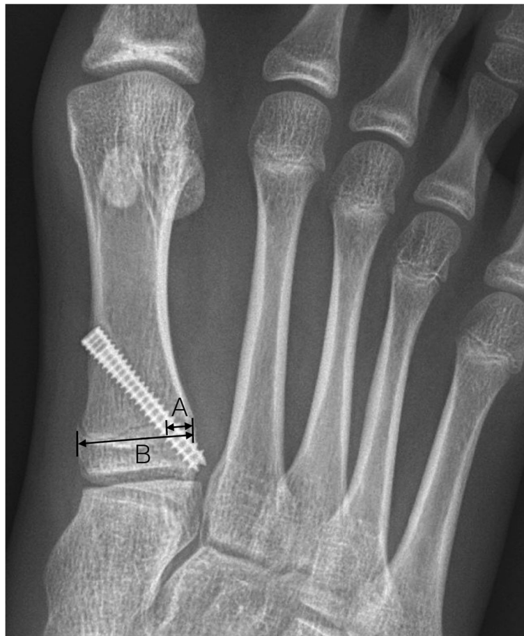
Fig. 2 Line A: from center of screw at physeal crossing to lateral border of physis parallel to line B. Line B: length of proximal physis, "A/B" represents screw position

All procedures were carried out identically by the two senior authors who worked as a team. With patient on supine position under general anesthesia and fluoroscopic control, a guided wire for the cannulated screw is positioned retrograde from the medial cortex of first metatarsal mid-shaft and pointed toward the lateral and