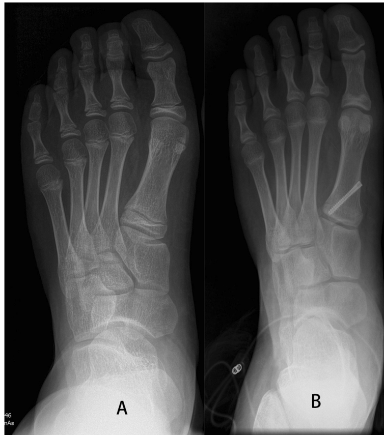
Fig. 4 a The case example shows the initial HVA was 25.5 degrees, and IMA was 8.5 degrees at age of twelve. b Two years and 2 months after the operation, the HVA improved to 14.6 degrees, and IMA improved to 4.7 degrees

hemiepiphyodesis of the first metatarsal is a reasonable alternative for the symptomatic or progressive juvenile HV [10, 11]. However, prior techniques used for lateral hemiepiphyodesis, either curettage or stapling, could not compare with percutaneous manner in simplicity and effectiveness.