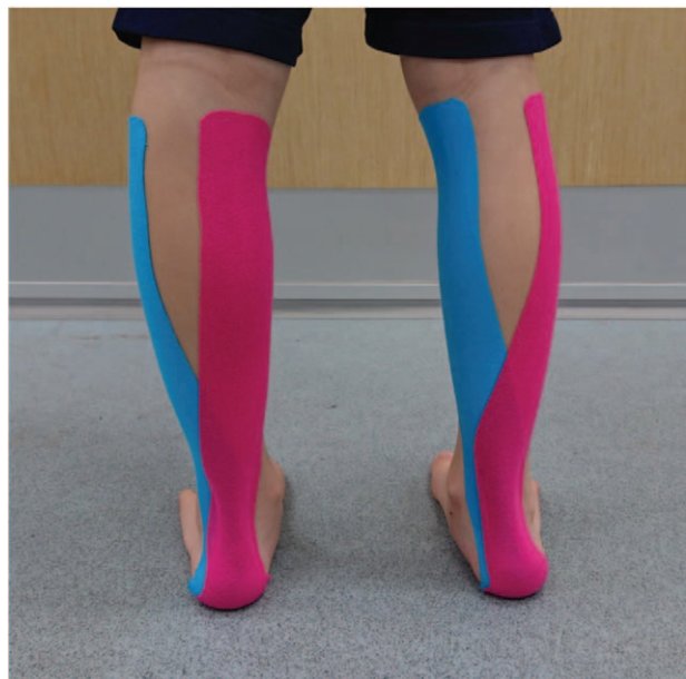
Figure 3. Kinesio tape application on the gastrocnemius muscle.

was first prepped with alcohol swabs and shaved where necessary to reduce skin impedance. Circular Ag/AgCl bipolar surface EMG electrodes (interelectrode distance of 1 cm) (EMG sensor SX230-1000, Biometrics, Newport, UK) were then applied to the right leg muscles (rectus femoris, biceps femoris, tibialis anterior, and gastrocnemius medialis) according to the locations specified by Barbero, Merletti, & Rainoldi. [23] The right limb was chosen based on the assumption of bipedal gait symmetry. Raw EMG data was sampled at a rate of 1000 Hz which was amplified ( \times 1000 ) with a bandwidth of 20 to 460 Hz (input impedance at >10^{15} \Omega and a common mode rejection ratio >96 dB). [24] A reference electrode (R506, Biometrics, Newport, UK) was placed at the ipsilateral tibial tuberosity. A pair of foot pressure sensors (FS4 contact switch assembly, Biometrics, Newport, UK) was