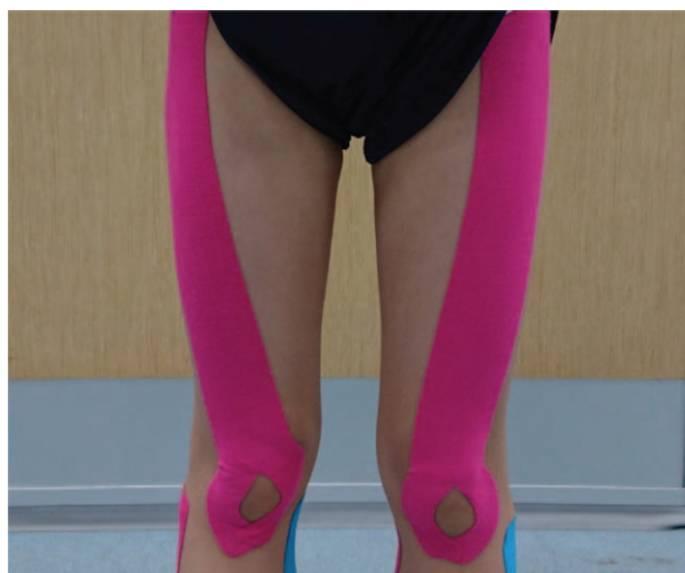
Figure 2. Kinesio tape application on the rectus femoris muscle.