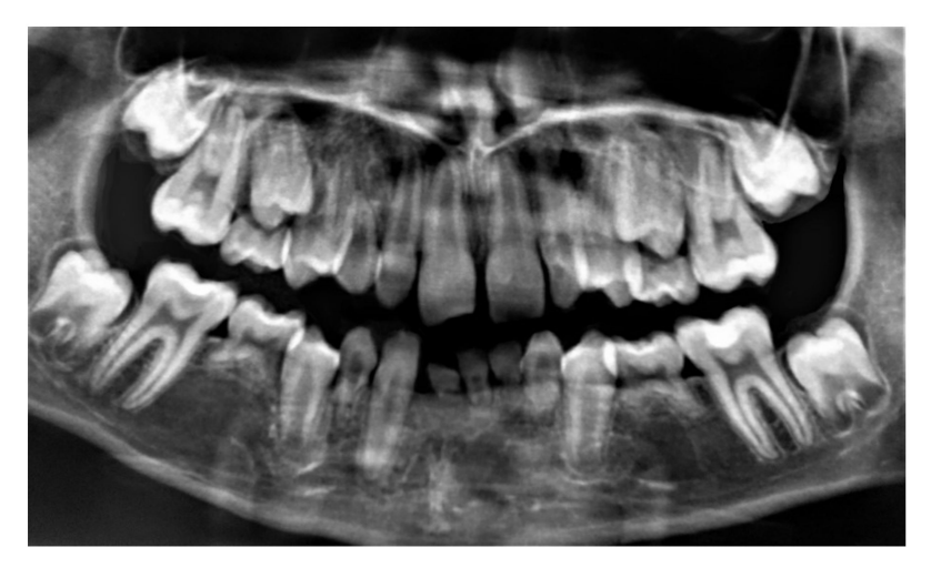
Figure 3. Oligodontia in a patient with Wolf-Hirschhorn syndrome.

With regard to dental abnormalities, 23 patients (74.1%) had delayed tooth eruption, 8 (25.8%) had microdontia, 8 (25.8%) had at least 1 peg-shaped tooth, and 2 (6.4%) had fused teeth. Of the 11 patients whose age and level of cooperation allowed for radiological tests, 7 (63.6%) showed dental agenesis and 5 (45.5%) showed oligodontia (Figure 3). The most affected teeth were the second molars in the temporary teeth and the second premolar in the permanent teeth (Table 4). Radiological findings also included 2 cases (18.1%) of taurodontism. We observed dental attrition in 26 patients (83.8%), caries in 7 (22.5%), and enamel hypoplasia in 3 (9.6%).