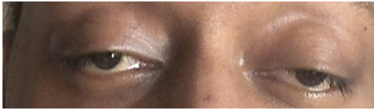
Fig. 1. Photograph of patient exhibiting bilateral ptosis and ophthalmoplegia at the time of admission.