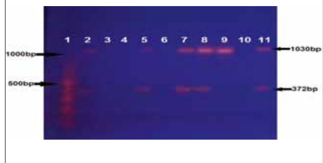
Fig. 1. Genus typing banding pattern of isolates Lane 1 = DNA ladder; Lanes 2, 5, 7 & 8 = MTC; Lane 9 = NTM; Lane 10 = negative control; Lane 11 = positive control (H37Rv).