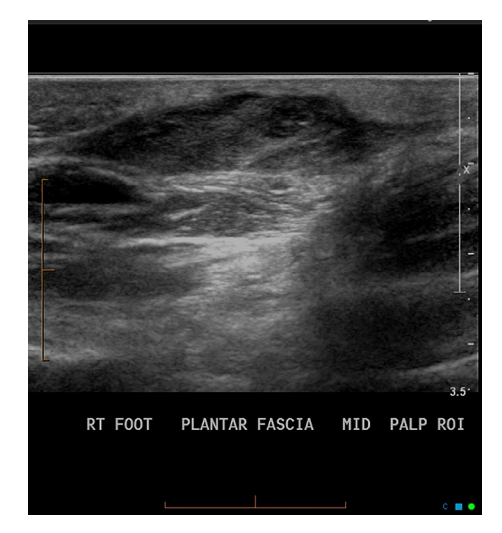
Figure 3 Plantar fibroma as seen on ultrasound. Note: Reproduced with permission; Case courtesy of Dr Chris O'Donnell, Radiopaedia.org, rID: 30471.<sup>44</sup> Abbreviation: RT, right.

Figure 2 Sagittal T2 MRI demonstrating a plantar fascia fibroma. Note: The fibroma has low-to-intermediate signal relative to muscle. (Reproduced with permission; Case courtesy of Radswiki, Radiopaedia.org, rID: 11776).<sup>43</sup>