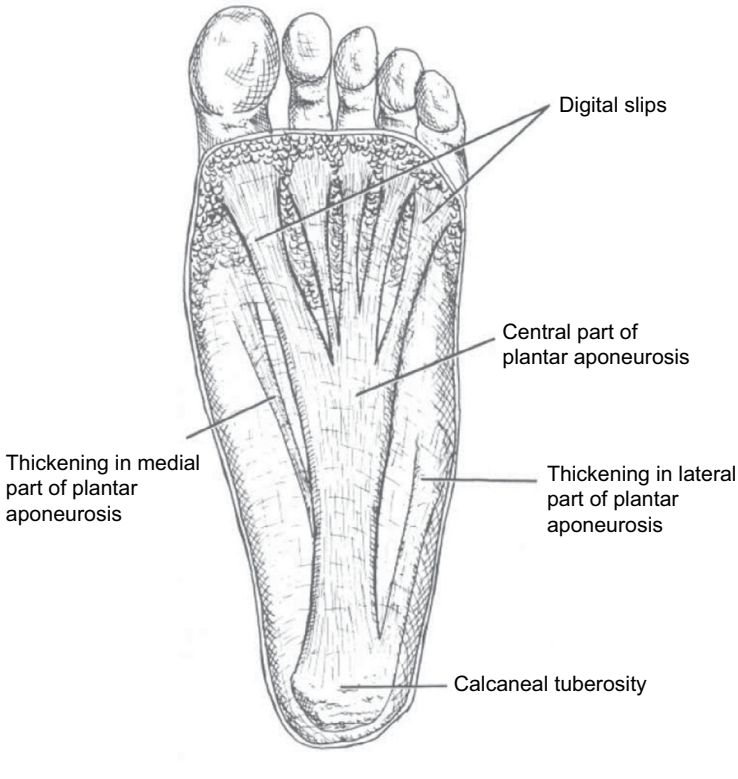
Figure I Anatomy of the plantar fascia. Notes: Adapted from Gramatikoff.<sup>42</sup>

especially with weight bearing. When an individual dorsiflexes his or her toes, the plantar fascia tightens, the distance between calcaneus and metatarsals is decreased, and the medial longitudinal arch is elevated. This dynamic mechanism has been described as the windlass mechanism, reflecting its similarity to tightening a cable in an efficient, predictable manner. This series of events is critical for maintenance of the gait cycle, where even minor arch collapse can cause great inefficiency in ambulation.<sup>3</sup>