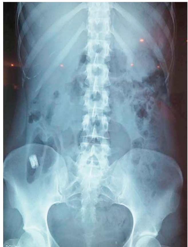
Fig. 2 Plain abdominal X-ray: patency capsule in the right iliac fossa.

The symptoms resolved spontaneously within up to 72 hours in 13 (65%) patients. Five (20%) patients were treated with systemic corticosteroids with subsequent resolution within up to 1 week. One patient required ileocecal resection and in another, the patency capsule, which was retained in the esophagus due to a Schatzki ring, was advanced to the duodenum endoscopically. This patient underwent diagnostic SBCE (introduced endoscopically) that was normal and uneventful.