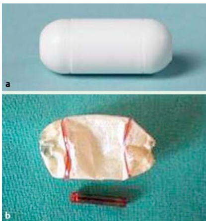
Fig. 1 Second generation patency capsule before ingestion (a) and upon excretion 60 hours after ingestion (b).

the patency capsule in the small bowel by plain abdominal film (XR), computed tomography (CT), or HHS within or after the defined excretion time.