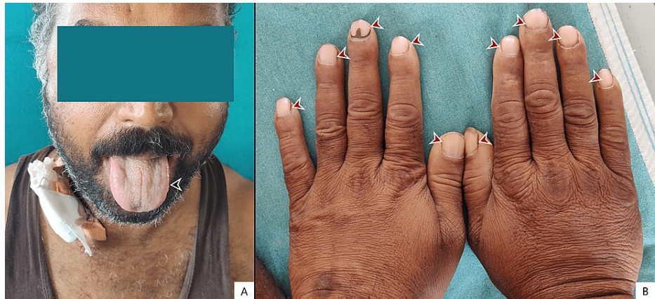
FIGURE 1: Physical examination findings showing pale tongue and pale nail beds suggestive of anemia.

respiratory rate of 34 cycles per minute, and a saturation of 98%. Physical examination showed a moderately built lethargic male with pale conjunctivae, tongue, and pale nail beds as seen in Figure 1. There was no clubbing, icterus, or cyanosis present. The rest of the physical and systemic examinations were unremarkable.