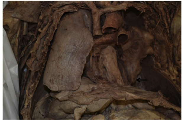
Fig. 3. Anterior view of the chest after removal of the heart, showing deformed and fibrotic left lung. Note diminutive left lower lobe (arrow).