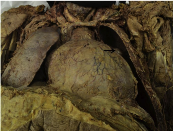
Fig. 1. Anterior view of lungs and pericardial sac after removal of the anterior chest wall. Note the tip of superior lobe of left lung protruding over the left contour of the heart (arrow).