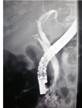
FIGURE 1: During the repeat ERCP a stent was placed in the terminal bile duct. Intrahepatic biliary ducts appear significantly narrowed.

Clinical manifestations of liver amyloidosis are not frequent and usually are not mentioned. Hepatomegaly is one of the leading signs in these cases [2], often causing right upper quadrant fullness and discomfort, as in our case. Moreover symptoms associated with food intake, such as early satiety, nausea, dyspepsia, and weight loss, are also noted [3]. Other signs and symptoms are relatively uncommon and mild. Ascites can be found in some patients [4], but it is usually present in patients with systemic amyloidosis (e.g., in patients with congestive heart failure or nephrotic