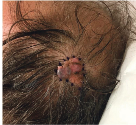
FIGURE 1: Clinical appearance of left parietal lesion at presentation to dermatology clinic.