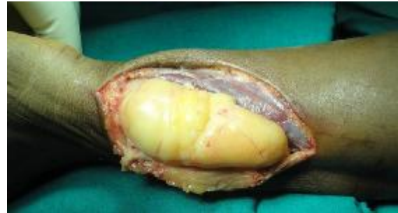
Fig. 3: Lipomatous appearance of the tumor.

block with tourniquet control. Longitudinal incision was made on the ulnar border of the distal forearm. The FCU was stretched, and displaced outwards. On reflecting the FCU, the mass was exposed (Figure 3).