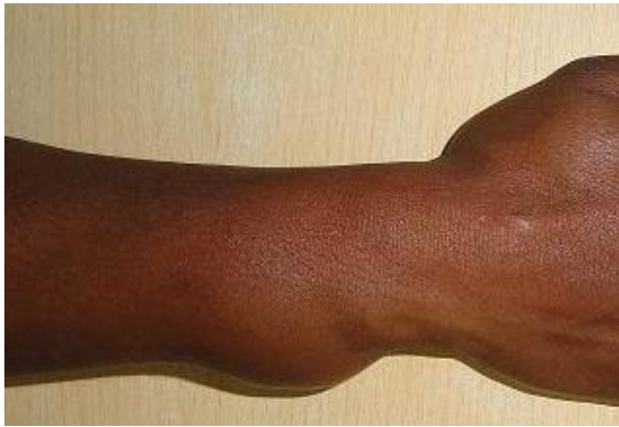
Fig. 1: Gross appearance of bulged tumor.

numbness at palmar aspect of fingertips in the ulnar nerve territory of the right hand since the past four months. She also complained of an asymmetric progressive swelling of her right distal forearm since the past two years. Physical examination revealed a soft tissue swelling localized to the ulnar border of the distal forearm extending volarwards and dorsally. The mass was non-tender and did not transilluminate. The grip strength, adduction and abduction and range of motion were symmetrical in both the hands (Figure 1).