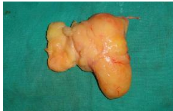
Fig. 4: Resected lipoma on the table.

Grossly, the mass was yellowish in color, lipomatous and multilobulated. The mass was gradually dissected (Figure 4). It extended from interosseous membrane on volar side to the interosseous membrane on the dorsal side encasing the entire distal ulna. As the ulnar neurovascular pedicle was at some distance from the mass and appeared largely uninvolved, no further exploration or neurolysis was considered.