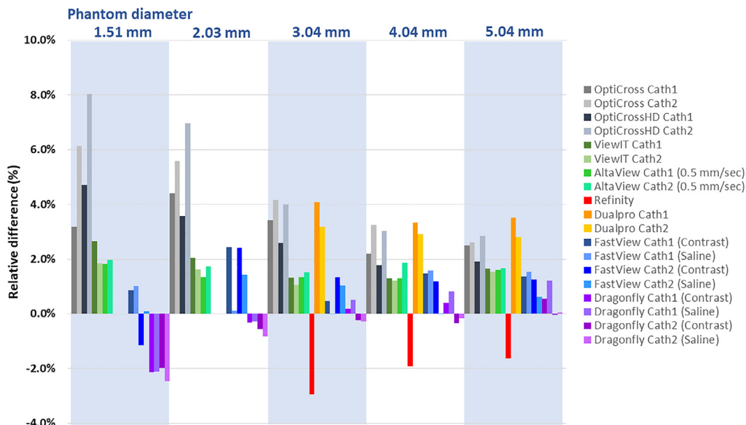
Fig. 2. Relative difference between measured lumen diameter and actual phantom diameter. The relative difference was calculated as the measured lumen diameter minus the actual phantom diameter divided by the actual phantom diameter. Cath indicates catheter.