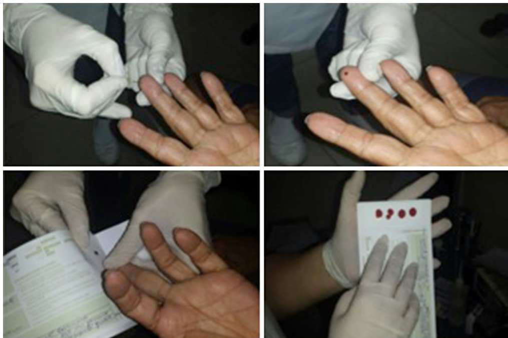
Fig. 1 Preparing the dried blood spots. Blood sample was collected by pricking the distal region of a finger and allowing the blood to drop onto a filter paper. The filter paper was put in an envelope and sent to the laboratory

Respiratory function tests. All the tests were performed using a spirometer (Vitatrace) coupled to Spiromatic