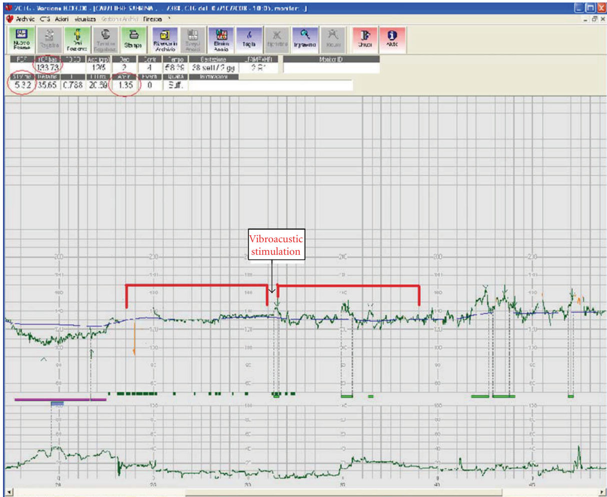
FIGURE 1: Example of computerized analysis of fetal heart rate tracing.