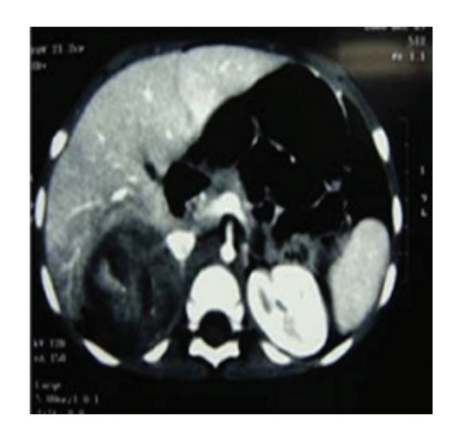
Figure 1: An abdominopelvic CT scan image shows a large oval shaped heterogeneous mass arising from the right adrenal gland with heterogeneous enhancement and pressure effect on right lobe of the liver.