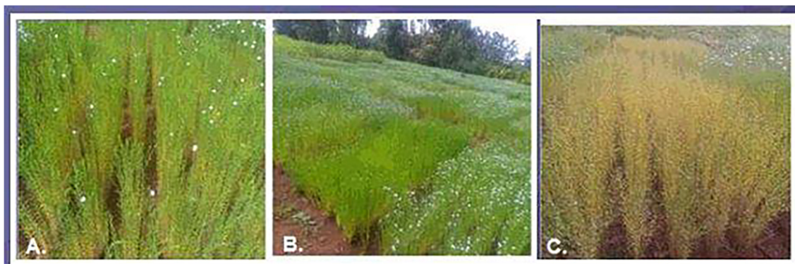
Fig. 1. A. Linseed field preparation and cultivation B. Linseed plants bearing a number of flowers in the erect branches. C. Matured crop ready to harvest.

The experiment was arranged in 6x6 simple lattice designs. Each entry was planted in a plot having 6 rows of 3 m length. Four rows were harvested and two border rows were excluded to avoid the border row effects. The area for each experimental plot was 3 m × 1.2 m = 3.6 m 2 and the total experimental area was 17.9 × 25.5 = 456.45 m 2 . The fertilizer was applied for the crop at the rate of 23/23 kg N / P2O5 kg per ha -1 at the time of planting and seed rate was 25 kg ha -1 . All other agronomic managements were applied uniformly in all experimental plots accord to the recommendation of crop. Agronomic, yield and yield related data were collected from four central rows of 10 randomly selected plants. Seed yields were adjusted to moisture content 7%. Data were collected for each and every parameter on the bases of the data were collected under both field and laboratory conditions.