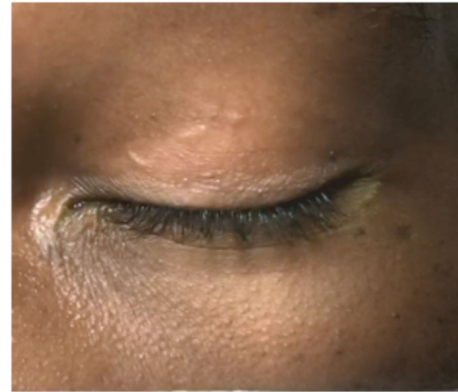
FIGURE 1: External photograph of left periorbital region which demonstrates a thin, serpentine lesion of the left upper eyelid near the eyelid crease.

Currently, it is estimated that greater than 10 million people are infected with Loa loa [1]. Endemic areas encompass much of Western and Central Africa with the highest prevalence of disease being in Cameroon, Gabon, Equatorial