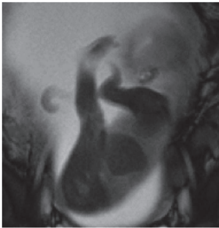
FIGURE 2: Fetal MRI at 26 weeks of gestation showing short forearms and hypoplasia of hand fingers.