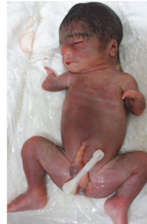
FIGURE 3: External examination showing a low hairline, synophrys, low-set ear, hypertrichosis, and smooth long philtrum with thin lips. The neck appears short and broad.

short and broad. Finally, CdLS was diagnosed. Autopsy and genetic and chromosomal analyses were declined.