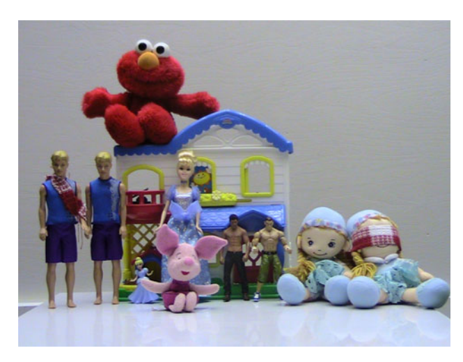
Fig. 1 The figure displays the stimuli used in the experiment. The doll in the front shows the main protagonist Piglet. The dolls behind Piglet show (from left to right) the two male dolls used in the basket task, the two princesses used in the balcony and the dog's house task, the two male dolls used in the wall task, and the two girls used in the letter task. The doll on the top of the toy house is Elmo who has been employed for the balcony and the dog's house task

After admitting that he could not perform the action himself, he articulated that he could ask one of his friends for help. He subsequently approached his friends. The experimenter asked the child to show him which of his two friends Piglet would ask for help, using the same test question: "What do you think: Which of his friends is Piglet going to ask for help?" If the child did not react, the question was repeated in another wording: "Who is Piglet going to ask for help?" If the child made the correct choice, he or she was further asked to justify why Piglet would ask this friend and not the other. The order of tasks was balanced among participants with the exception of the balcony task and the dog's house task; as both tasks involved the same dolls, they were always presented after each other.