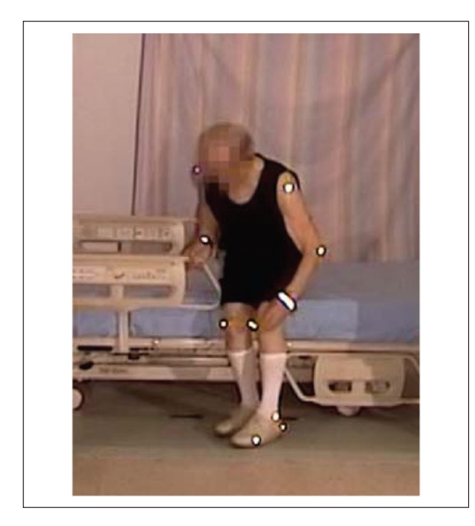
Figure 4. Using side rail for ingress.

heels and their hands to lift their pelvis off the bed. Then, they pushed with their feet to move up in the bed or with their arms to move down the bed.