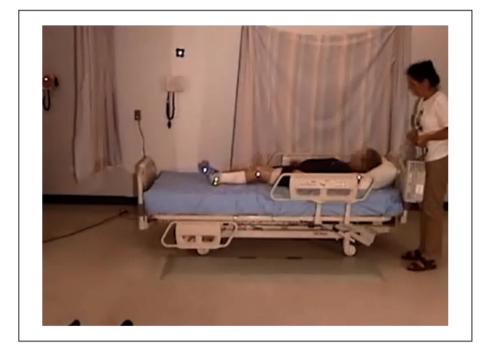
Video 5. Hip hitches to move up the bed.

bed. Ten participants used a hip hitch to move up in the bed, with one participant using 7 "bounces" including 3 hip hitches (Video 5)