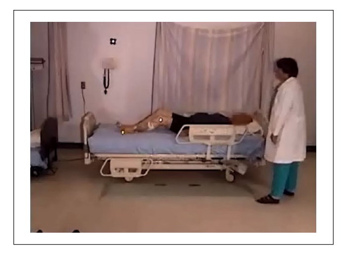
Video 3. Front first, ingress with uncontrolled descent.

Side rails up, standard 23" bed. Details of each participants' movements for ingress, turning, and egress with side rails up are listed in Table 2. We observed participant stability (or imbalance) as he or she reached the bed and turned, their use of the side rails (and any assistance required), their control of