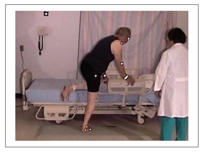
Figure 5. Front first, ingress, uncontrolled.