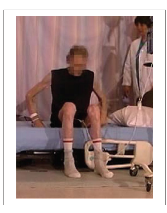
Figure 9. Tall participant, low bed.

2 participants required assistance to regain balance, and 1 used a walker (Video 12).