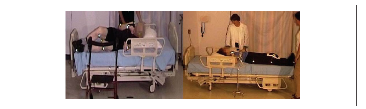
Figure 7. Participant is too low in the bed.