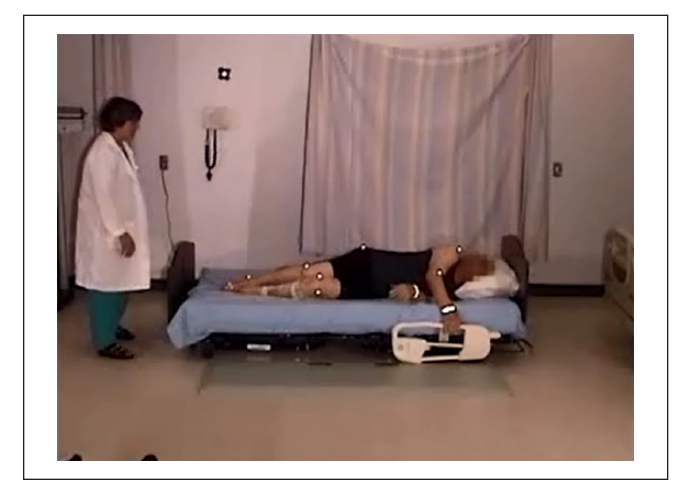
Video 10. Participant pulling lowered rail to turn.