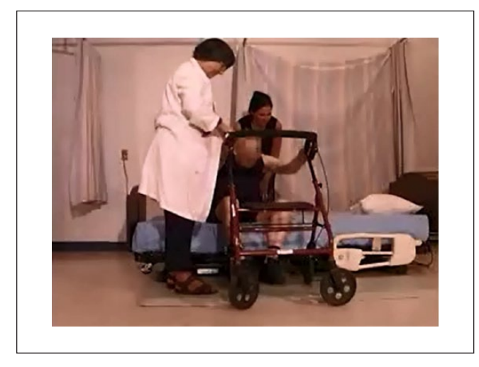
Video 9. Walker not supportive, ingress low bed.