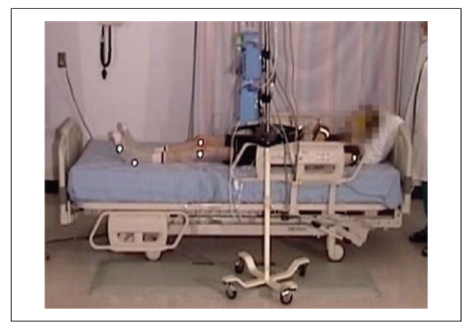
Figure 8. Participant is too high in the bed.