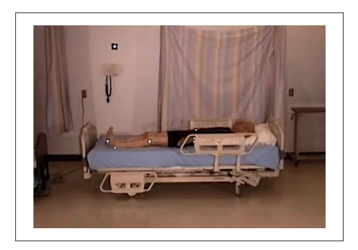
Video I. Normal gait, ingress.

Note that the hip hitch (Natale et al., 2009) was also used with the participants in supine position, to move up or down the bed, or to turn over. With each hitch, they pushed on their