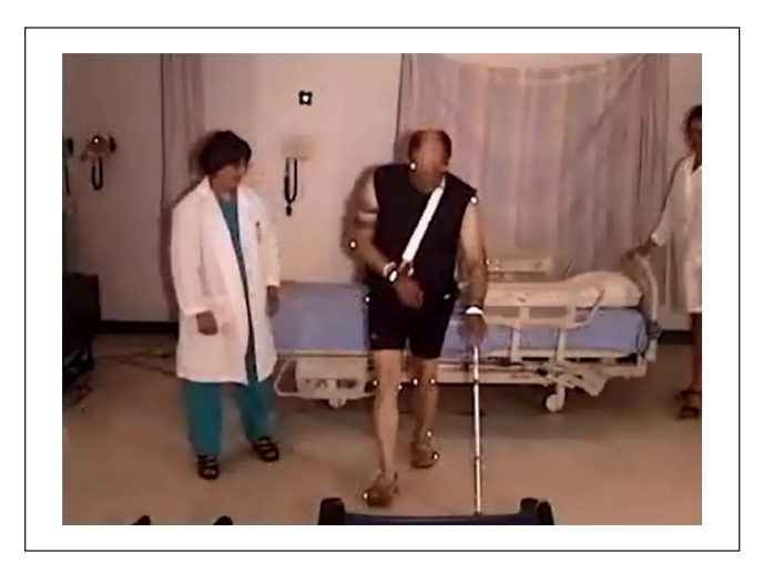
Video 7. Egress around raised side rail.