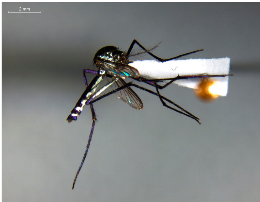
Figure 2. Haemagogus (Haemagogus) janthinomys Dyar, 1921, collected in Area 4 in December 2017.

All YFV RNA-positive samples of the primary screening were isolated and confirmed via RT-qPCR. The number of viral RNA copies per milliliter obtained seven and 10 days after isolation are provided in Figure 3b. Quantification ranged from 10^6 to 10^8 copies of viral RNA/mL. Of the 13 isolated samples, 12 presented an increase in virus replication profile after 10 days compared to seven days. Only one sample did not present positive growth after seven days. Cells without supernatant inoculation (negative control—Mock) were indeed negative on RT-qPCR. The Ct value of the isolated samples are available in Table S3 in the supplementary material.