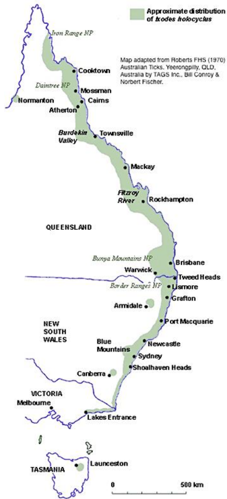
Fig. 3. Approximate distribution of the paralysis tick, I. holocyclus , in Australia.

Teong et al.: Conjunctival Attachment of a Live Paralysis Tick, Ixodes holocyclus , in a Child: A Case Report