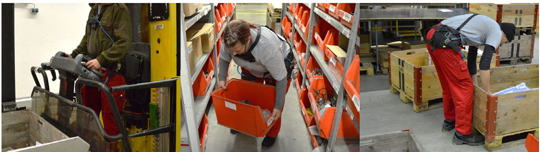
Figure 1. Field trial of passive exoskeleton Laevo V2.5 while stocking components and order picking.

The final sample comprised of N = 31 employees aged 20–56 ( M = 35.42 years, SD = 10.90 ). Due to an inherently high proportion of men working in the logistics department of the company, more than 92% according to their own statement, the share of women participating in the study was, as expected, small (9.7% female, 90.3% male, and 0% nonbinary), though it does reflect the department's actual gender distribution. While 12.9% of participants reported to be slightly familiar with exoskeletons, mostly through media reports, 87.1% did not have any prior experience with this technology.