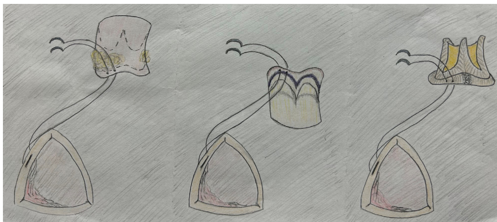
FIGURE 1. Envisioning the LVOT anastomosis with the autograft or homograft as a standard bioprosthetic aortic valve replacement.

anastomosis, the pliant pulmonary autograft and aortic homograft, hereon referred to as the “graft,” obstruct visualization of suture placement. We demonstrate an adoptable framework, the inverted-graft mattress technique, that transforms the challenging LVOT anastomosis into one familiar with most cardiac surgeons. Institutional review board approval was not required. Informed written consent was obtained to include patient information in the included video.