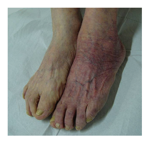
FIGURE 4: Acrodermatitis chronica atrophicans.

1-2% and it is the most common kind of B-cell pseudolymphoma of the skin [1].