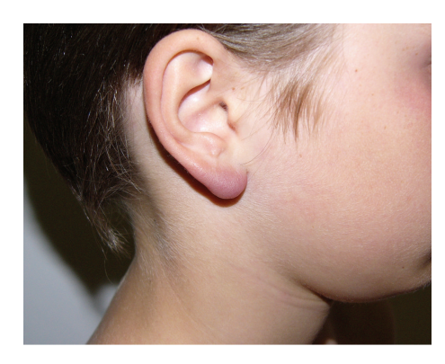
FIGURE 3: Lymphadenosis benigna cutis.