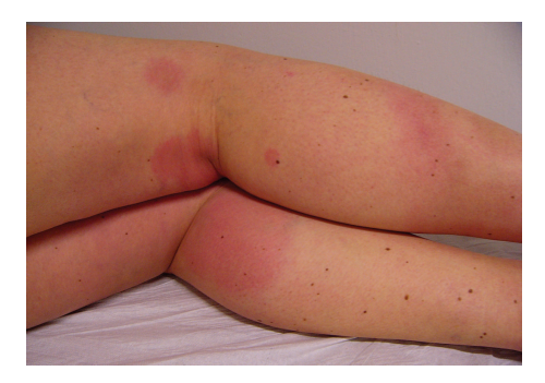
FIGURE 2: Multiple erythema.

The manifestations of LB recorded in this study are similar to the ones of other endemic areas in Europe, presenting a widespread clinical expressivity, even if there are some peculiar features which are different from those reported in Northern Europe and mostly in the USA, proving the existence of several genospecies of Bb differently distributed throughout the various geographical areas [4–10].