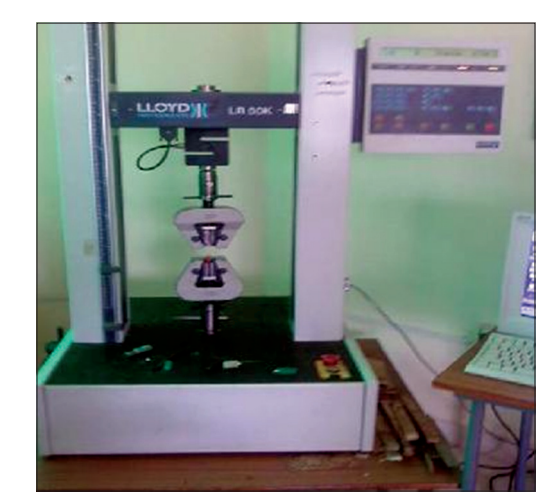
Figure 2: Instron testing machine