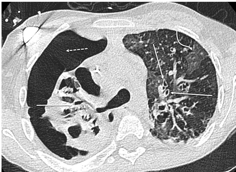
FIGURE 1: CT image chest without contrast.

Multiseptated large right pneumothorax (dotted arrow), septations not shown. Advanced findings of CF with bilateral bronchiectasis (solid arrows) and concomitant ground glass infection (curved arrow).