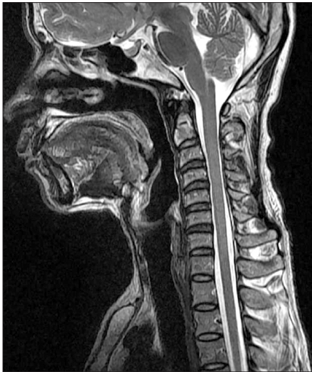
Fig. 3. Degeneration grades of the cervical intervertebral discs in magnetic resonance imaging are as follows: C2–3, grade I; C3–4, grade II; C4–5, grade II; C5–6, grade III; C6–7, grade III; and C7–T1, grade II.

tribute to physical and mental values (physical component summary [PCS] and mental component summary [MCS]), which provide glimpses into mental and physical functioning and overall health-related quality of life. PCS and MCS are computed using the scores of 12 questions and range from 0 to 100, where 0 indicates the lowest level of health and 100 indicates the highest level of health.